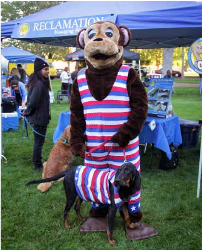
Otto Otter of Reclamation's Pacific Northwest Region shared canal safety tips at the See Spot Walk event in Boise, Idaho.

some drowning deaths that have occurred due to access from the trails that run near canals and ditches. Anytime the public is introduced to these areas, the possibility of accidental drowning increases.