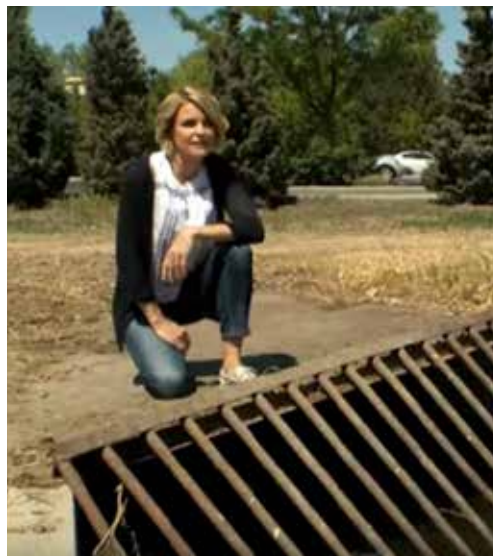
From Nampa & Meridian Irrigation District's canal safety YouTube video.

By using the proper licensing process, property owners